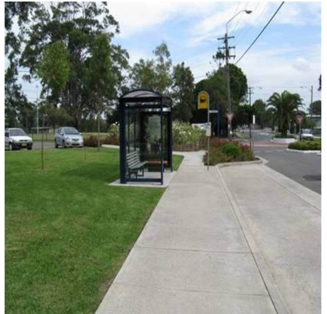
Age friendly bus stop