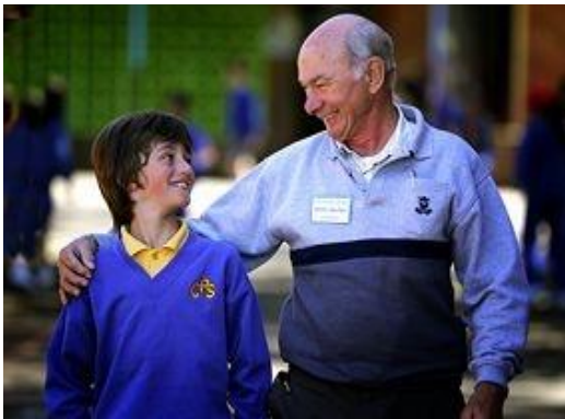
Grandfriend - Casula Public School

Council on the Ageing (NSW) Inc Estab. 1956