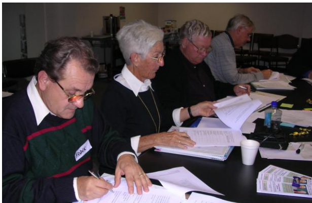
Peer Education volunteer training program